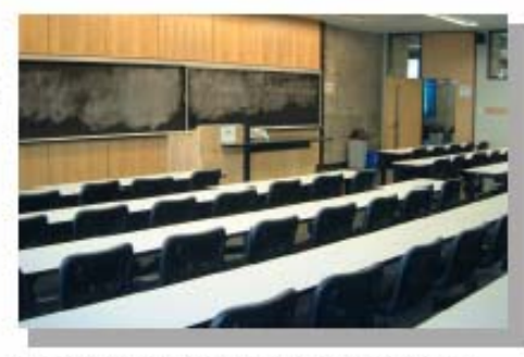
Trottier Building classroom where ExCESS Academic lectures are held.

Sponsorship provides the resources for organizing and maintaining our seasonal series of lectures on the research being done at McGill. These lectures allows students to explore the types of departmental research and experiments conducted in our labs, as well as obtain genuine academic counseling for those interested in pursuing graduate studies.